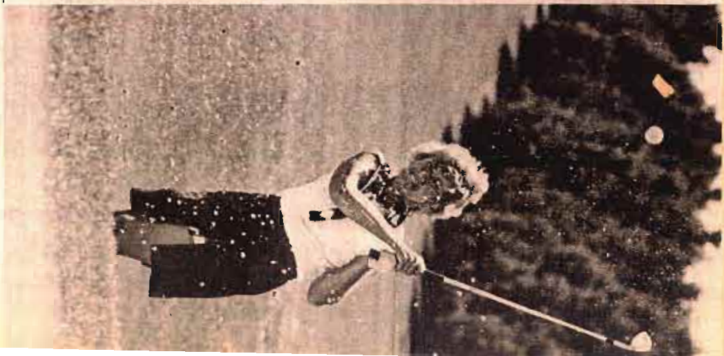
today's final 18 holes at the Elks Country Club.