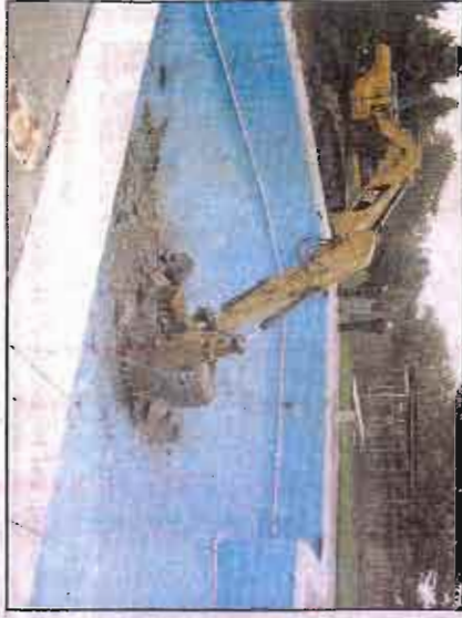
An excavator demolishes the swimming pool at Lochland Country Club Sept. 12.